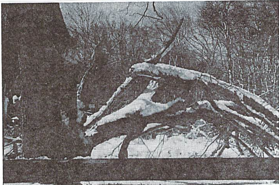
This historic tree on surplus St. was one of many of Duxbury's storm victims.